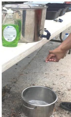
Approved Flip Spout